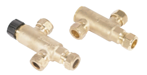
Atmos Solar diverter valve and Thermostatic Mixing Valve - both used as in connecting MonoSolar to the HE32 boiler

• The Solar Diverter Valve (SDV) maximises the efficiency of the system by diverting the hot water straight to the hot taps when it is above 45°C, so that the boiler is by-passed and does not fire up unnecessarily. Below 45°C the SDV sends the water to the boiler, which tops up the hot water to the temperature set on the boiler. The Thermostatic Mixing Valve is a user adjustable safety feature to prevent scalding.