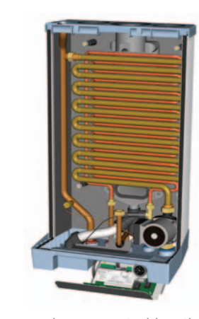
b. Cutaway shows central heating loop